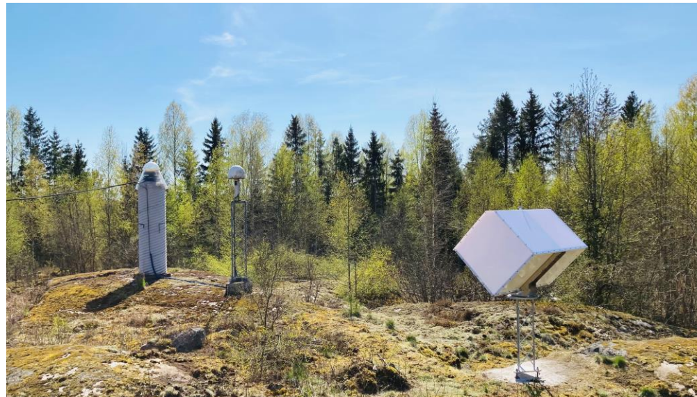
Squared double back-flipped CR in Karlstad.