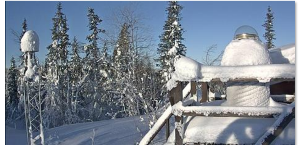
Wide-brimmed OSOD radome to the right.