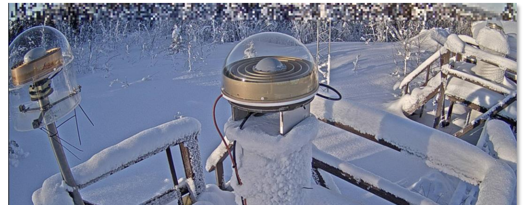
OSOD radome with bottom plate to the left, OSOS radome to the right.