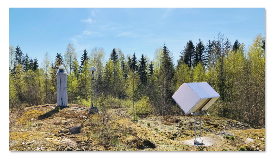
Squared double back-flipped CR in Karlstad.