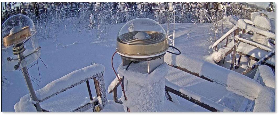
OSOD radome with bottom plate to the left, OSOS radome to the right.