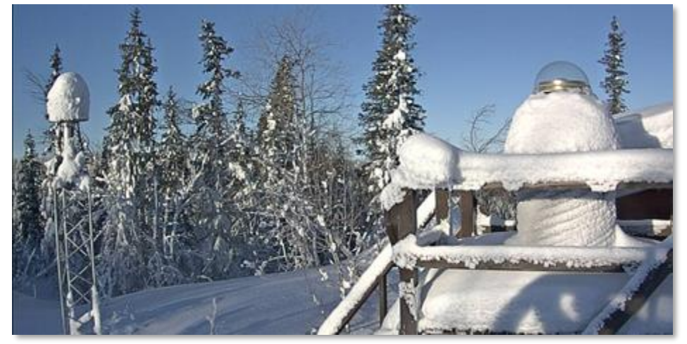
Wide-brimmed OSOD radome to the right.